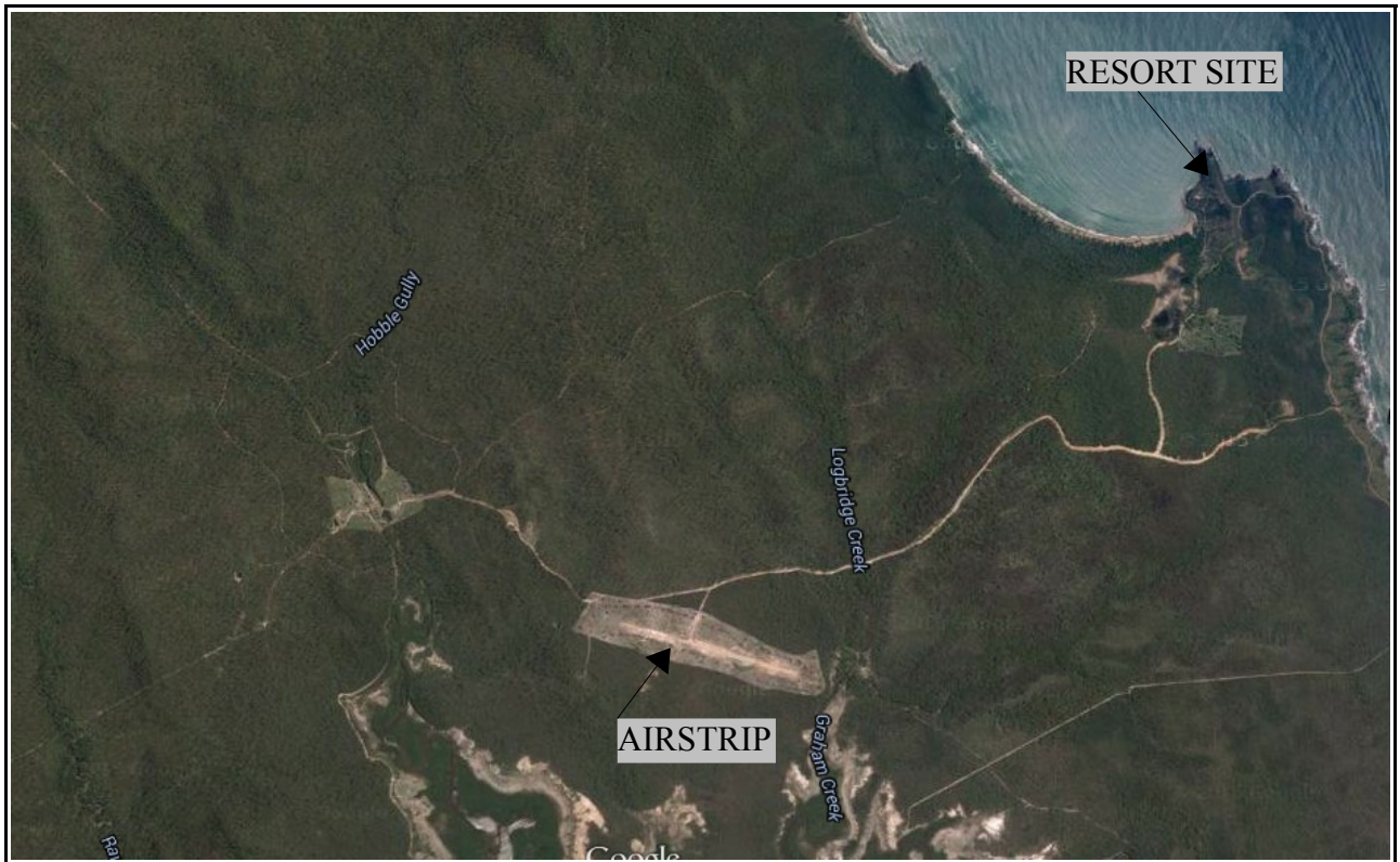
Figure 2.0. Aerial Photograph of site.