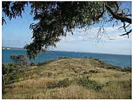
ROCKY HEADLAND COASTAL VILLAS